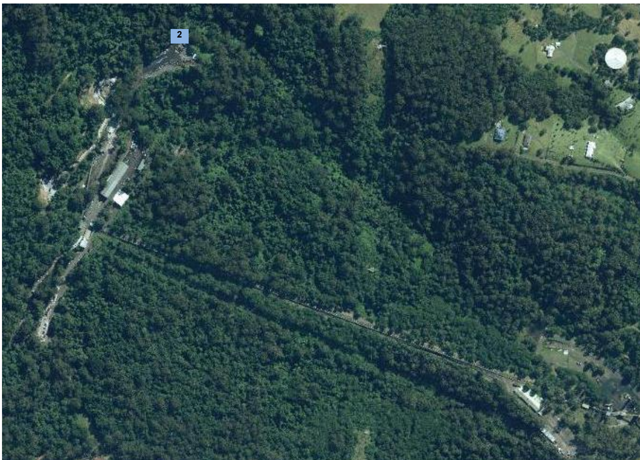
Figure 2 - Licensed Discharge Point 2 at Wongawilli Pit-Top Area