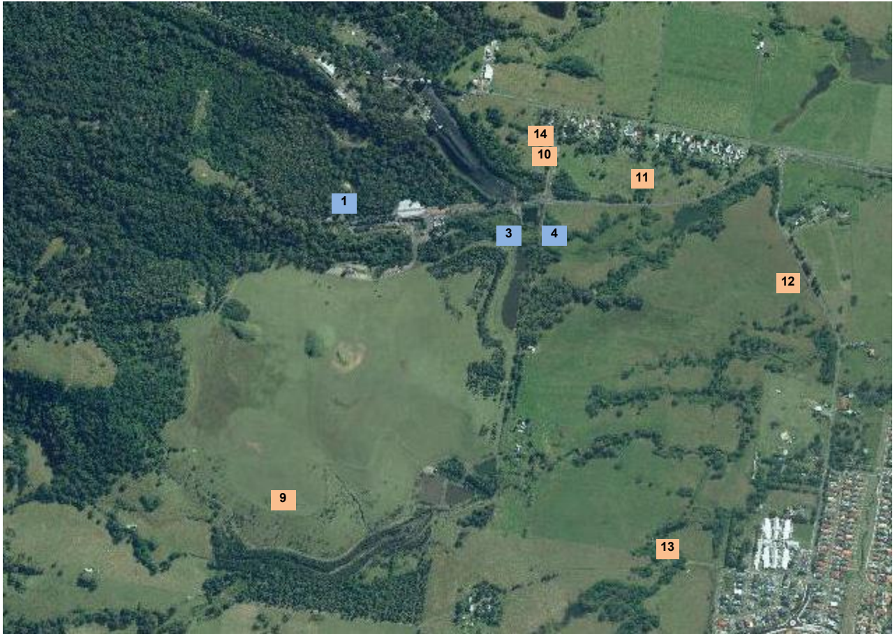
Figure 1 - Licensed Monitoring and Discharge Points at Wongawilli