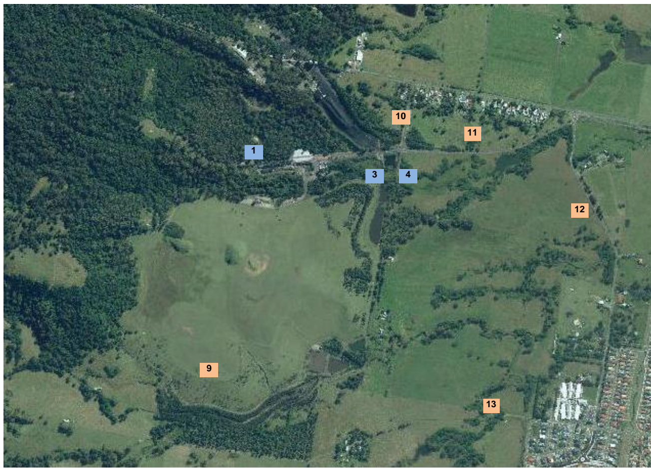
Figure 1 - Licensed Monitoring and Discharge Points at Wongawilli