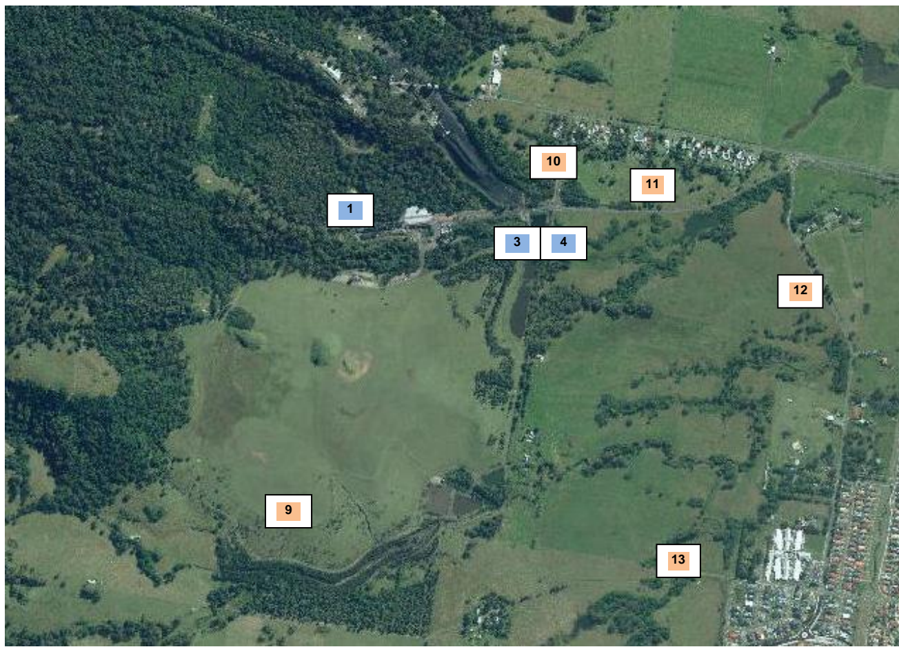
Figure 1 - Licensed Monitoring and Discharge Points at Wongawilli